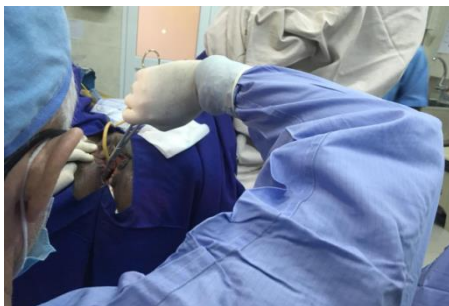
E: For both the backhand and reverse forehand grip, keep your right elbow up and out as you hold the needle-holder like a pen.