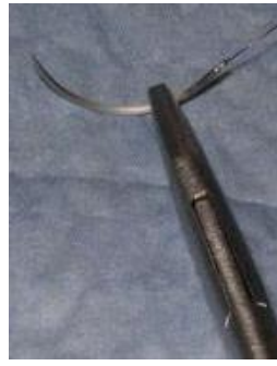
C: Mount the needle in the usual way so the point is facing to your left.