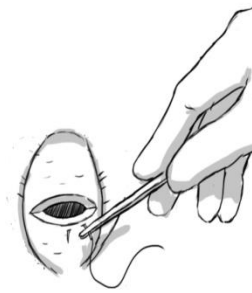
B: Shows the backhand grip being used. The needle-holder is held like a pen.