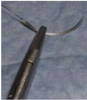
A: Mount the needle so the point is facing to your right (when holding mid-prone)

Reverse forehand grip: If you want to stitch going from the patient's right to left. This is mainly used on the right side (see Figure C and D)